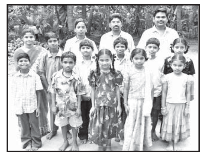
3rd to 5th Class