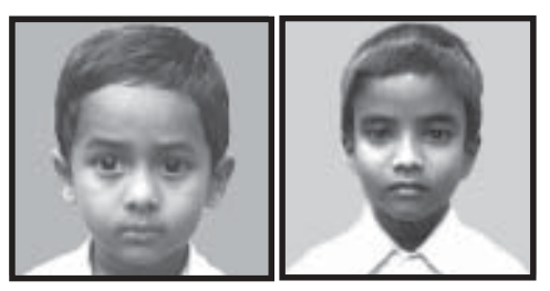
G Satish E. Mahesh Upper Kindergarten (6 Students)