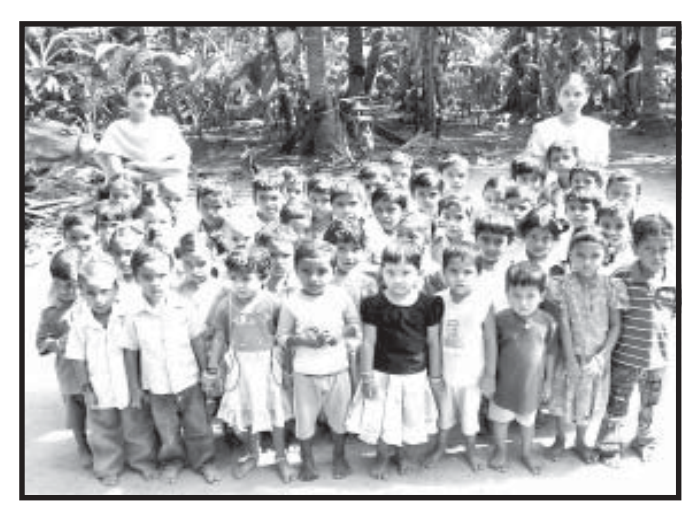
Nursery and Kindergarten