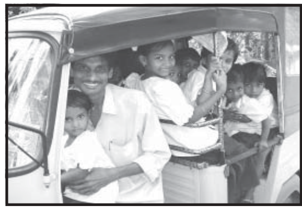
Aquilla with children